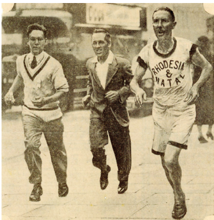
HIS LAST, AND BEST.—South African, Arthur Newton, 51 yesterday, celebrated event by breaking own record by eleven minutes in last long-distance run of his career. Sped from Box, near Bath, to Hyde Park Corner—100 miles—in 14hrs. 11mins. 30secs. Shown above in Knightsbridge nearing the finishing point.

The 20th July 2009 was the 75th Anniversary of Arthur Newton's 100 mile road running 'Best on record' run from the Bear Inn near Bath to Hyde Park Corner in London. He was 51 years old and it was to be the last record he set before his eventual retirement from competitive road running. The World record 100 mile road record he set of 14 hours 6 mins is still today a 'very respectable time for the distance'.